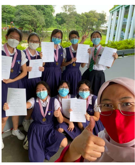
Project Mindflayer after Nationals FPSP Finals 2021!

"The strength of the RGS sisterhood is definitely what most of us treasure the most after the 4 years, because they not only left moving memories, but also a renewed maturity in how we perceive strength. I've discovered so much through working in all the teams I've been in, like my CmPs group Project Mindflayer, and in the Triple C Programme, and come to prioritise the personal connections and emotional depth from interactions more than tangible results. In that regard, RGS has made meand many of us, who were conditioned to believe strength was standing alone – much more human, and I'm forever thankful."